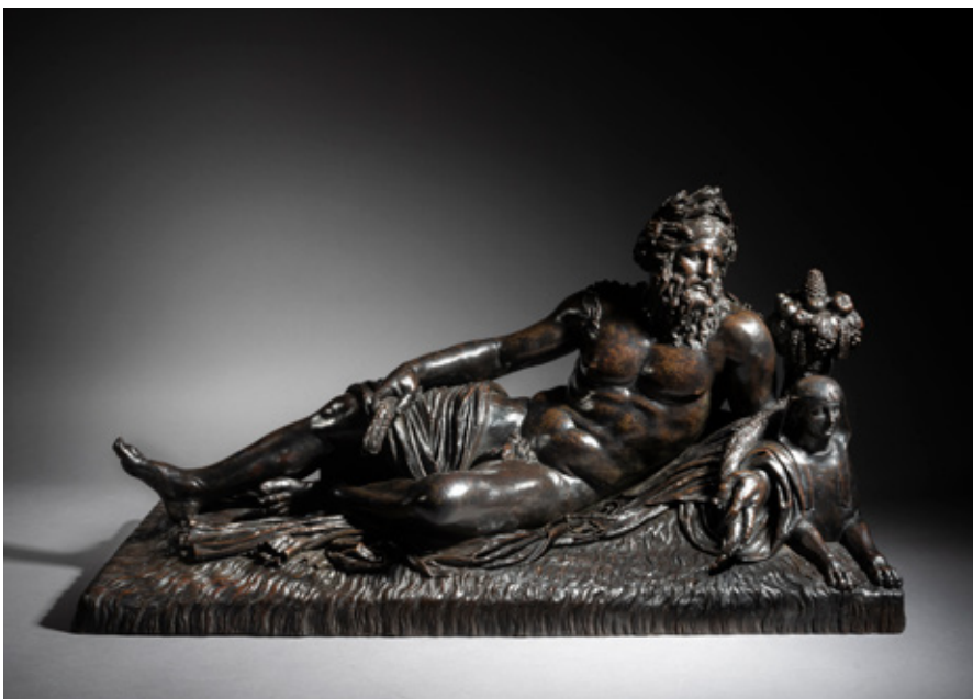
ALLEGORICAL FIGURES of the Nile and the Tiber French School, circa 1715 Pair of bronzes with red-brown patina Dim. 15 3/4 x 29 1/2 x 12 3/4 in and 17 x 29 3/8 x 13 in 200 000 - 300 000 €