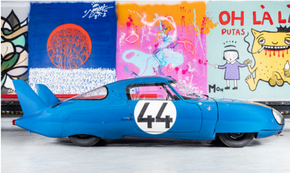
PANHARD-CD PROTOTYPE #LM64-02 - LE MANS 1964